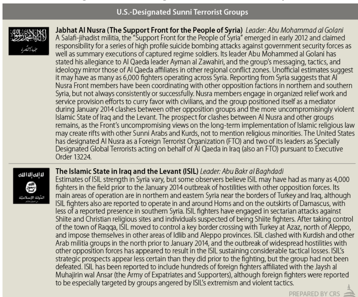
Figure A-2. U.S.-Designated Sunni Terrorist Groups